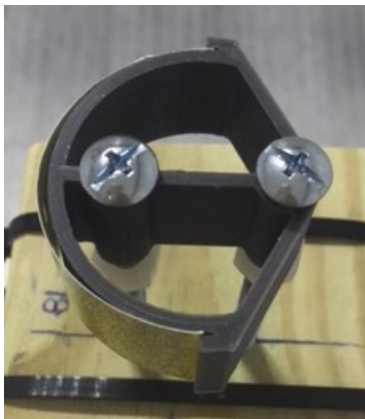
Figure 1: Liquid sensitive paper angled against semicircular object. The paper is inserted at 0° (bottom of picture) and at 180° (top of picture) to form a semicircular shape. The sprayer makes initial contact with the liquid sensitive paper at 0°.

In this study, each target surface was sprayed with either a traditional hand sprayer, a low pressure directional sprayer, or an induction charged electrostatic sprayer. The same volume of liquid was dispensed for each device. The target surfaces consisted of three liquid sensitive strips of paper angled against a semicircular shaped object (figure 1). A tripod with a fixed opening for a delivery system was positioned at a distance of 36 inches from the target surface, facing 0°. Each target surface was divided into four sections for data analysis. This design allows for quantity of solution to be quantified. The strips were measured for saturation and the percent area covered was calculated in each 45° section using ImageJ software (NIH).